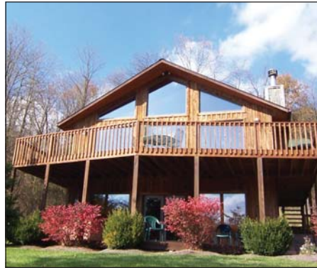
The William Travis Lodge, above, is one of the welcoming lodges and cabins at Crockett’s Run.

Crockett’s Run in the Hocking Hills offers a premier setting for business retreats, weddings, receptions, romantic getaways, reunions or any special event. Enjoy a secluded private setting in the peace, tranquility and beauty of nature.