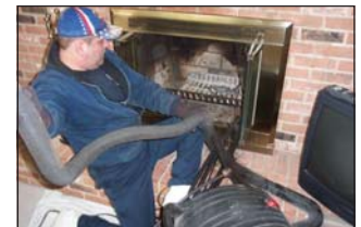
Chimney cleaning and inspection from Whempys

Whempys has been central Ohio's chimney expert since 1979, with more than 60,000 satisfied customers. We provide the highest quality service possible, including chimney inspection, sweeping, repair, and furnace and duct cleaning. Winner of the chimney sweeps "Golden Top Hat Award" 1987-1997. Licensed, bonded, insured, residential and commercial work.