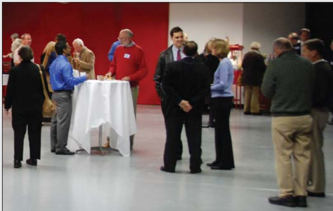
BAH PHOTOS BY KYLE WRIGHT, COMMUNICATIONS INTERN